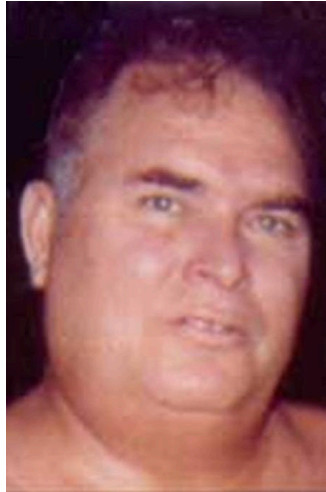
Photograph taken between 1995 and 1998