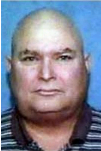
Photograph taken between 1995 and 1998

Unlawful Flight to Avoid Prosecution - Criminal Sexual Conduct With a Minor (Second Degree)