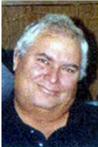
Photograph taken between 1995 and 1998