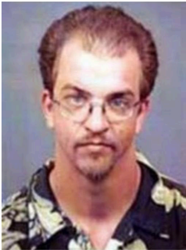
Photograph taken in 2001

Unlawful Flight To Avoid Prosecution - Failure To Appear (Lewd Act Upon a Child - 2 Counts)